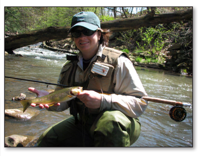
The Upper Stonycreek is a beautiful river with lush vegetation and many insect species, including an abundance of caddisflies nd stoneflies with a moderate population of mayflies. Stoneflies re especially active in the first few weeks of June, presenting the opportunity for a memorable day of fishing. The brochure from the Nountain Laurel Chapter of Trout Unlimited, "Guide to Fishing the nycreek River," has more specific details about fishing the river.