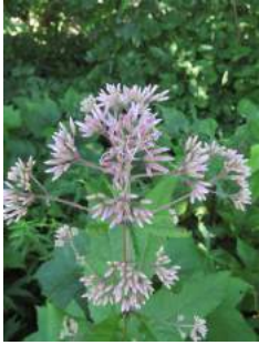
Joe Pye Weed

Penguin Court, the Scaife family's former estate in Laughlintown, is growing thousands of native plants for sale this spring and summer. Most are herbaceous perennials, but some trees and shrubs will be available, too. If you're looking for straight native species and not the cultivars found in most box stores and nurseries, watch for announcement of the sales listed below.