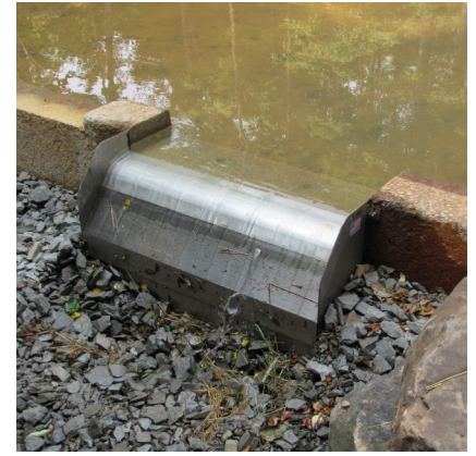
Left-Oven Run AMD Treatment System Site D aka Oaks Trail under reconstruction.