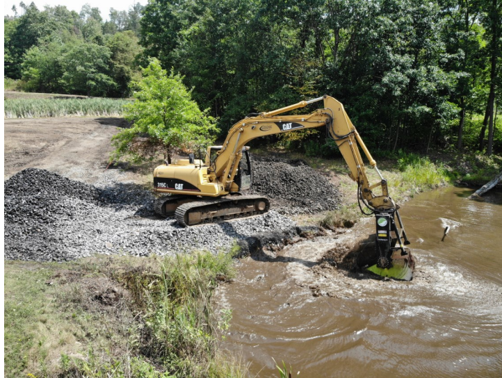
Washing of the limestone rock at Oven Run Site D. Other photos of Oven Run on page 2.

Reconstruction of Oven Run Site D, aka Oaks Trail, AMD treatment system is underway. Site D is one of the four Oven Run systems the Somerset Conservation District is legally responsible to perpetually maintain. The reconstruction of the site will consist of washing of existing limestone, new compost, new water control structures and the planting of a wetland. In addition, new interpretive trail signage will be installed after the project is completed.