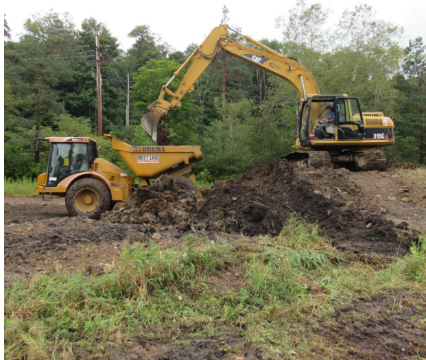
Soil is transported for the Hawk View Re-vegetation Project that will compliment the now completed reconstruction of the Oven Run Site F AMD Passive Treatment System.