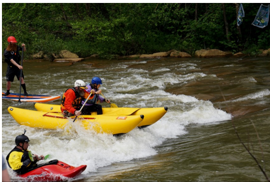
Kayakers at Whitewater Park during Stonycreek Rendezvous

diversity of fish reside in our rivers, and I bet several of you have a story about seeing a bald eagle in Johnstown or surrounding communities. Improving access to the water and making it easier for people to find these access points so time spent on the river can be as short as a couple of hours or day-long is essential to luring people to its edge.