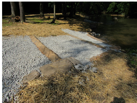
Boat launch at Orenda Park

In addition, a canoe and kayak launch was constructed as part of the project providing a secure location for those who use the waterway for floats downstream to the Quemahoning Reservoir.