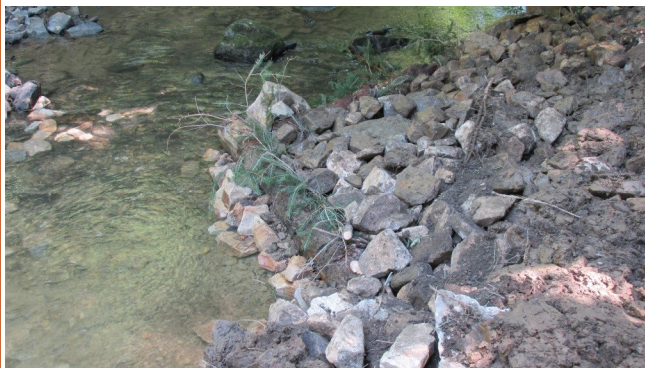
A completed log deflector on the South Fork of Bens Creek.