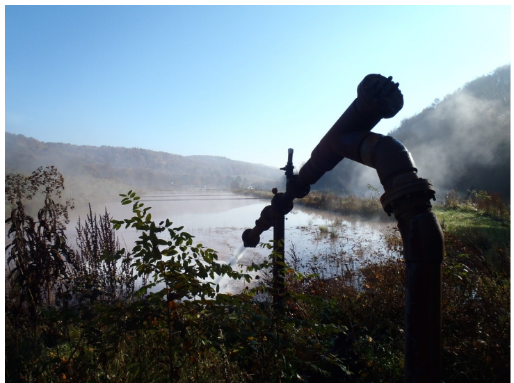
Spray nozzle at Lion Mining Company's Deep Mine Passive Treatment System on the Bens Creek