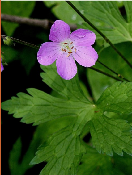
Wild geraniums, seen on the plant ID hikes, are common woodland natives that are attractive to pollinators.

Oct. 24-26- AMR Conference, Grand Hotel, Altoona, PA (See page 4.)