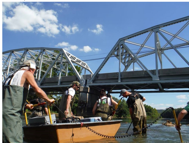
California University of PA professors and students, Westmoreland Conservation District's Watershed Technician, and the Stream Team's Director conducted a fish survey on the Conemaugh River in Seward in September.

Funding for this project is provided primarily through a Community Conservation Partnerships Program grant for which the Cambria County Conservation and Recreation Authority served as a pass-through and a grant from the Foundation for Pennsylvania Watersheds.