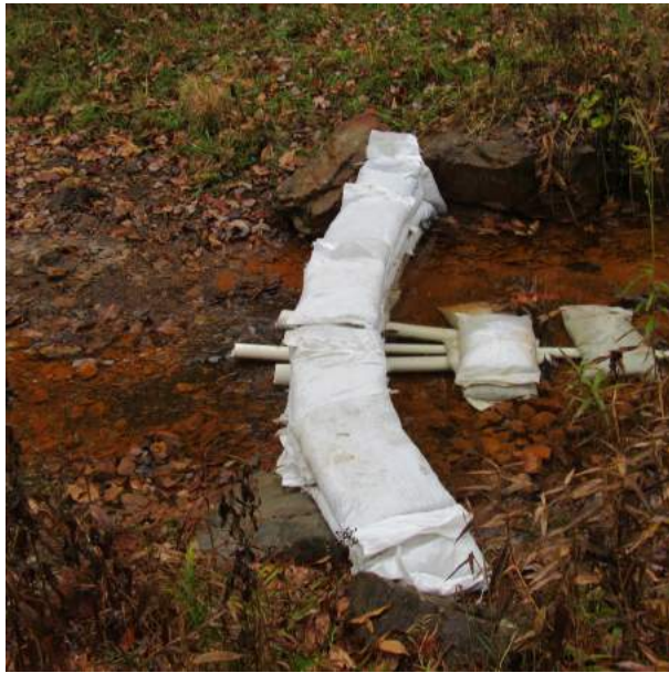
An oil absorbent boom placed in Oven Run just upstream from the intake for the Oven Run AMD Treatment System Site A.