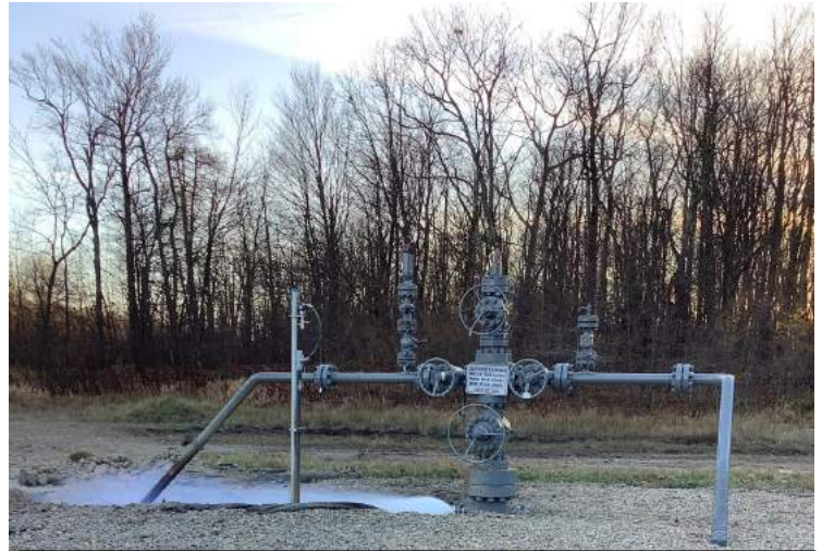
Gas Leak at Rager Mountain storage facility owned by Equitrans Midstream in Cambria County.