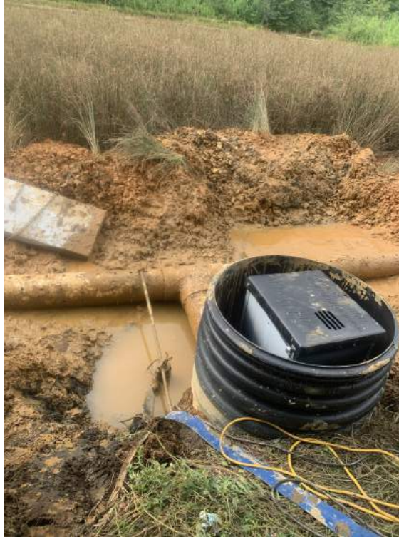
Excavation during the upgrades at the Rock Tunnel AMD treatment site on the South Fork of Bens Creek.