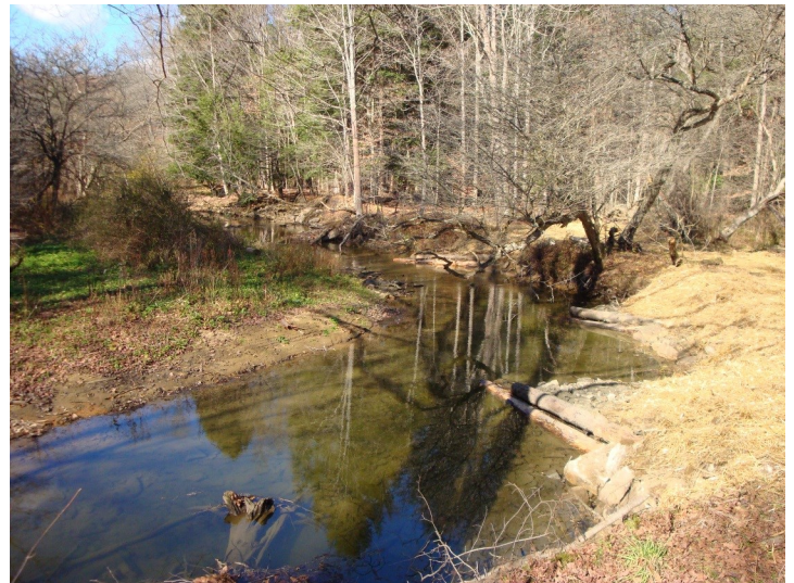
Howell's Run #3 After