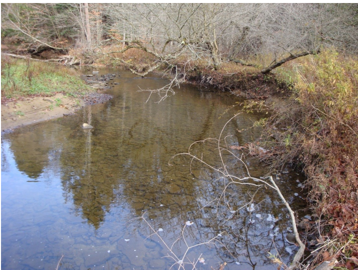
Howell's Run #3 Before