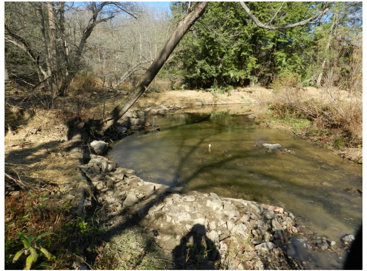
Howell's Run #2 After