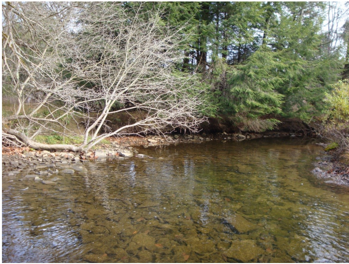
Howell's Run #2 Before